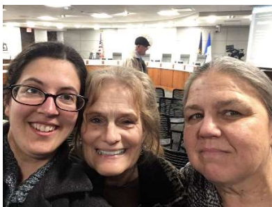
Attending City Commission