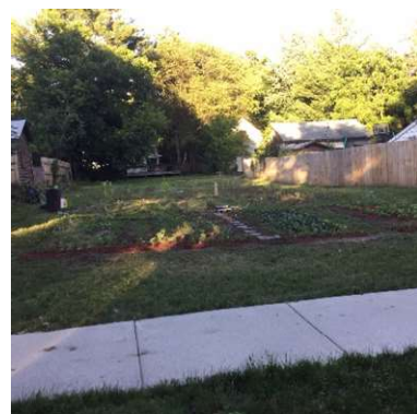
Garden at 762 North