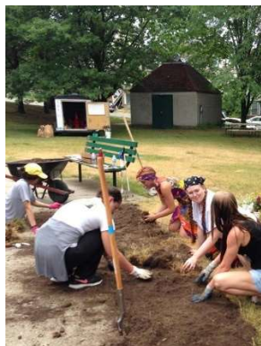
Park Clean Ups

The themes we have chosen to focus on for 2018-2021 include creating social and physical connections , being physically and civically active in the neighborhood, and being heard in local government. These areas are illustrated by recent activities, below: