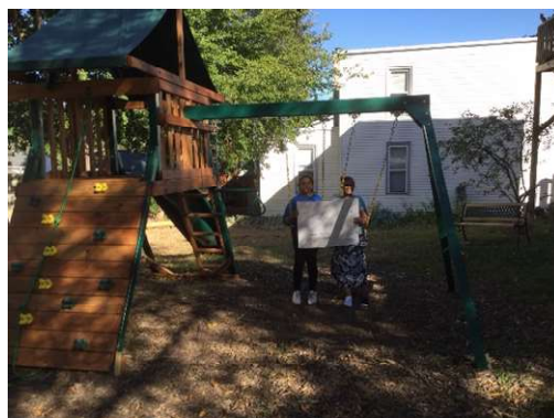
Community Space at 704 Clancy