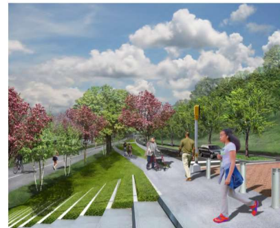
FIG 5.14: View of the proposed Ionis Street Linear Park.