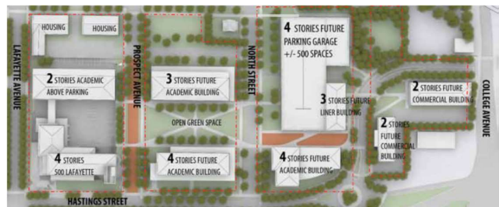
Left, Belknap hill (Fairview-Division) in Michigan Street Corridor Plan. Above, Hastings Connector in GVSU Master Plan.

Themes for these and other neighborhood activities are creating physical and social connections, being active in the neighborhood, and being heard in local government.