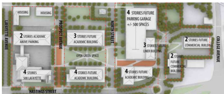
Left, Belknap hill (Fairview-Division) in Michigan Street Corridor Plan. Above, Hastings Connector in GVSU Master Plan.

Themes for these and other neighborhood activities are creating physical and social connections, being active in the neighborhood, and being heard in local government.